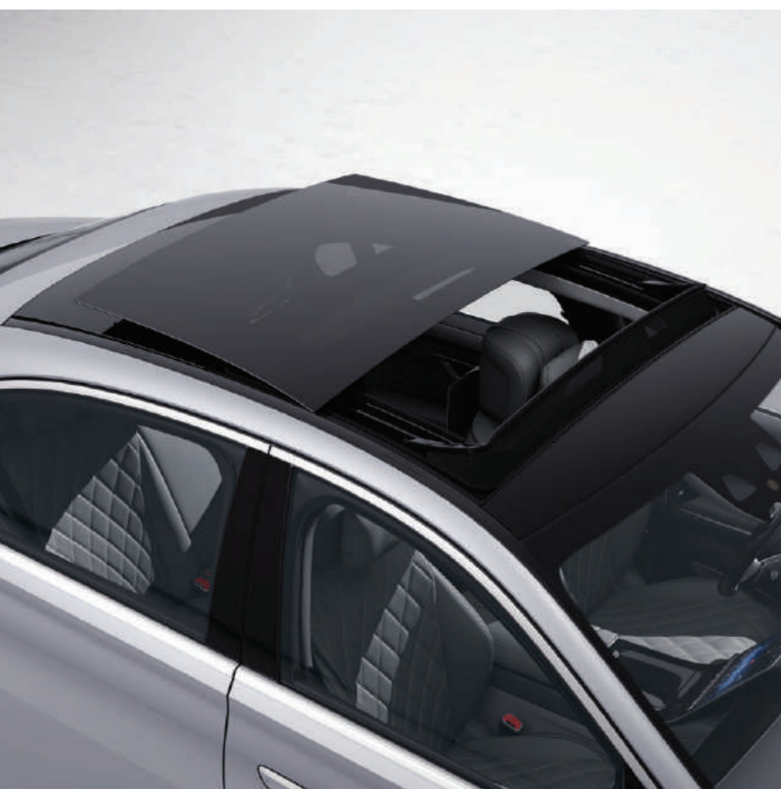
Panoramic sliding sunroof