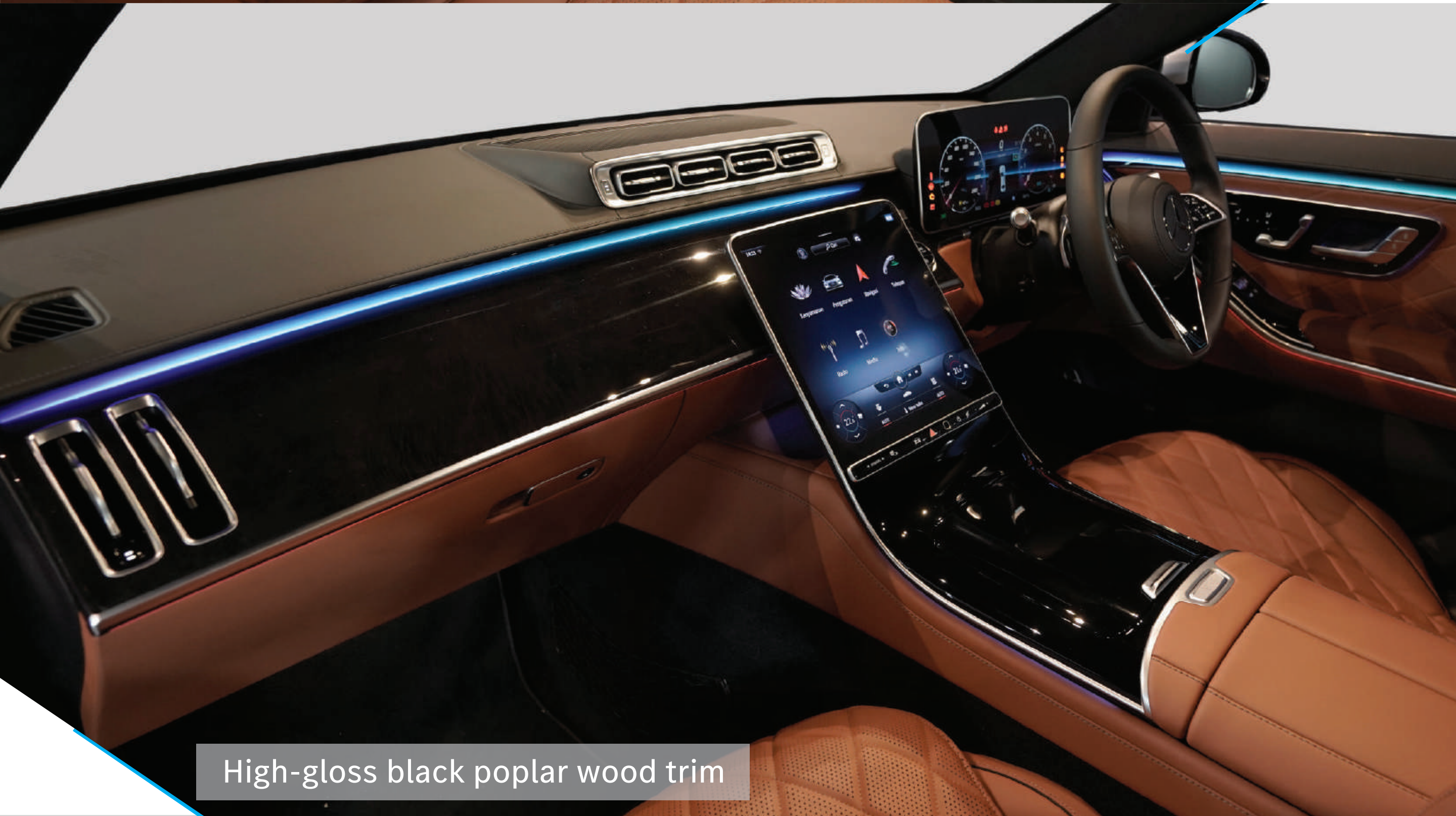
High-gloss black poplar wood trim