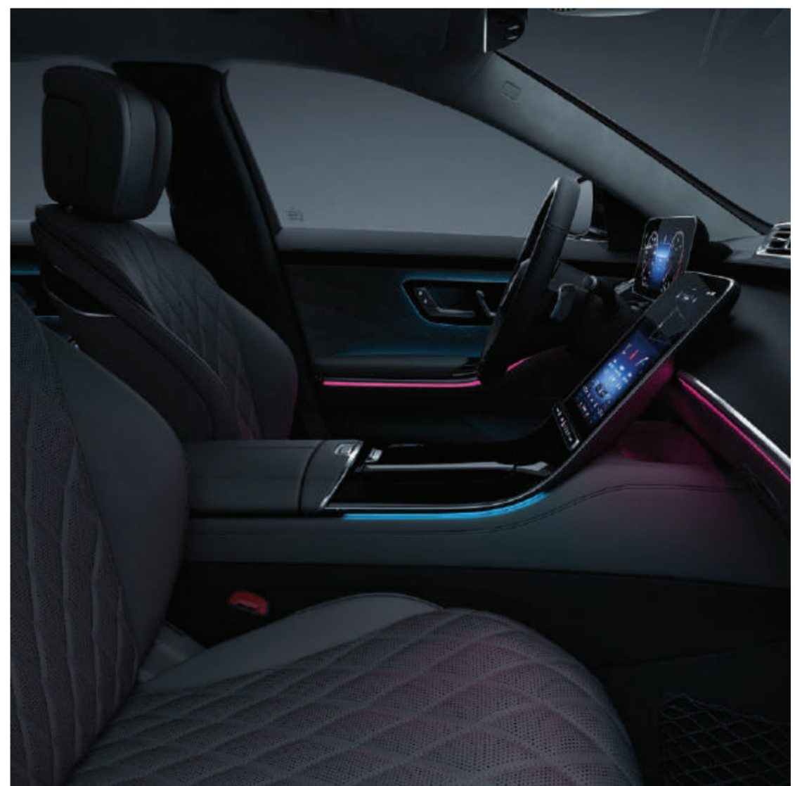
Active ambient lighting