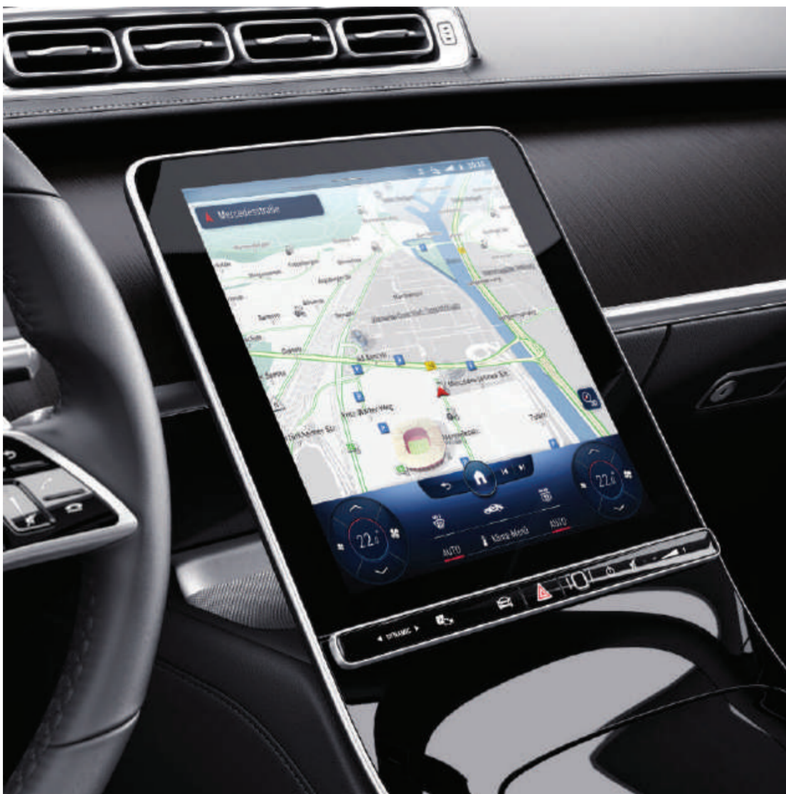
OLED central display