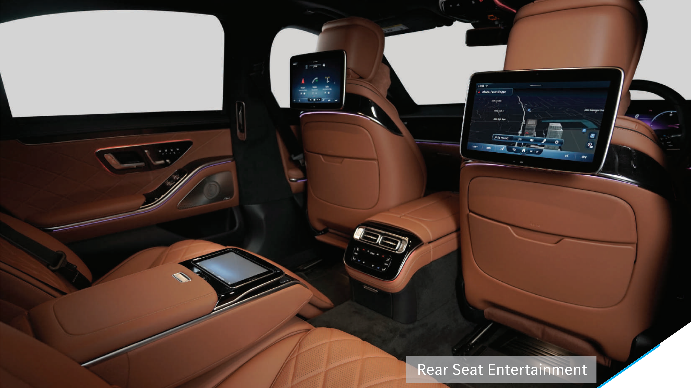
Rear Seat Entertainment