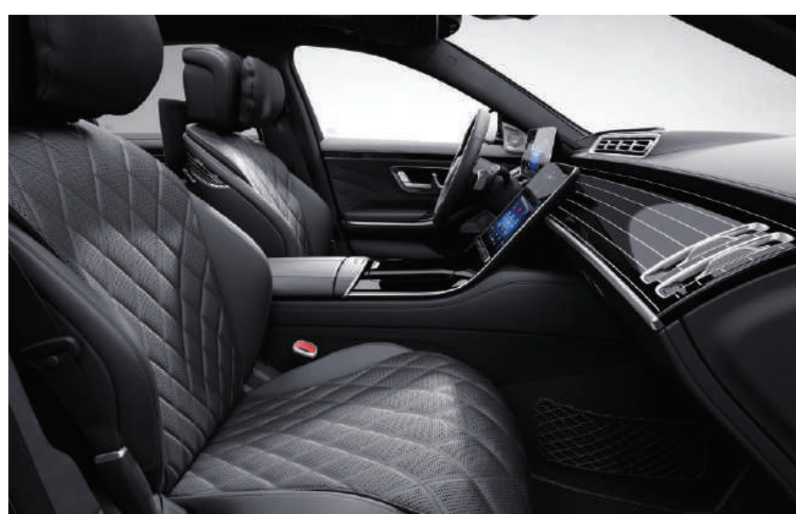
Exclusive nappa leather black