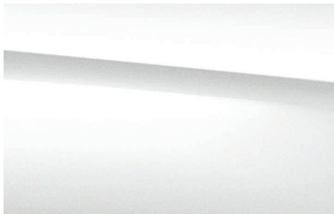
Diamond White Bright