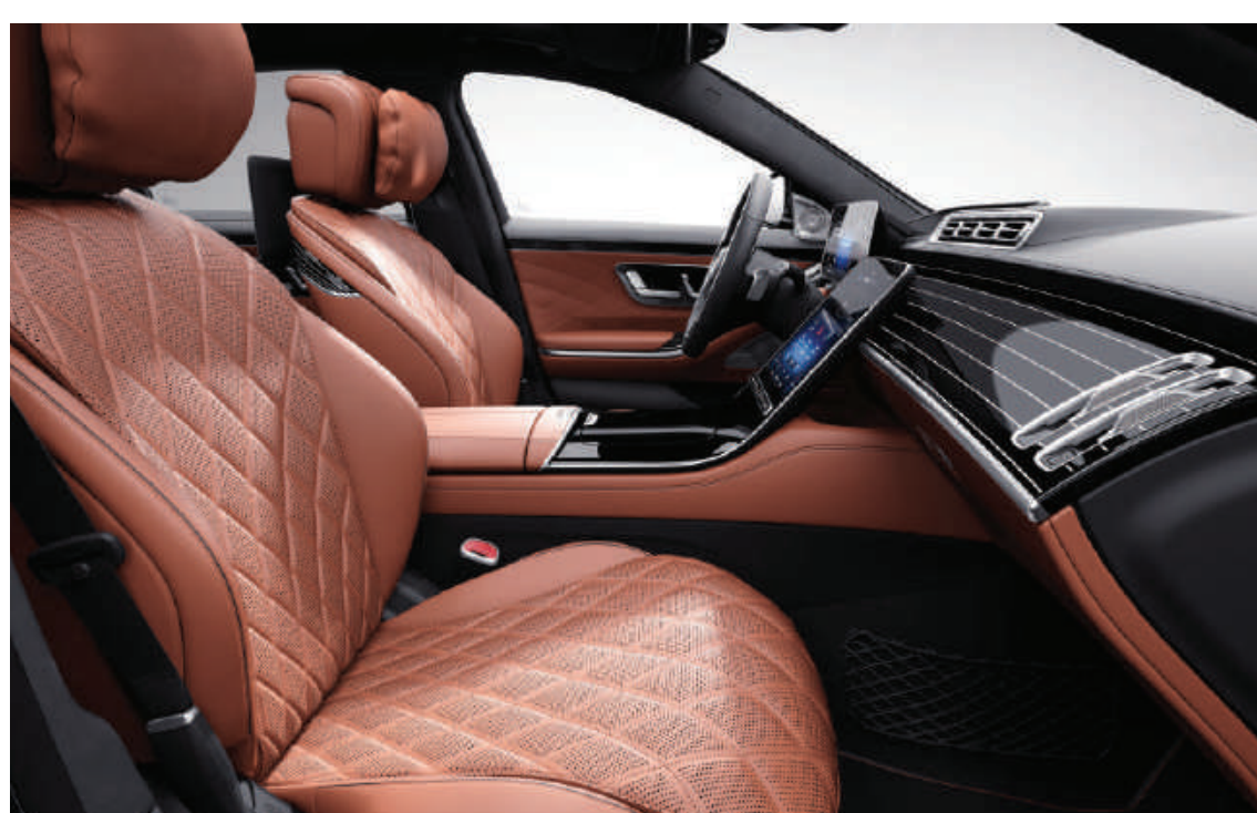
Exclusive nappa leather sienna brown